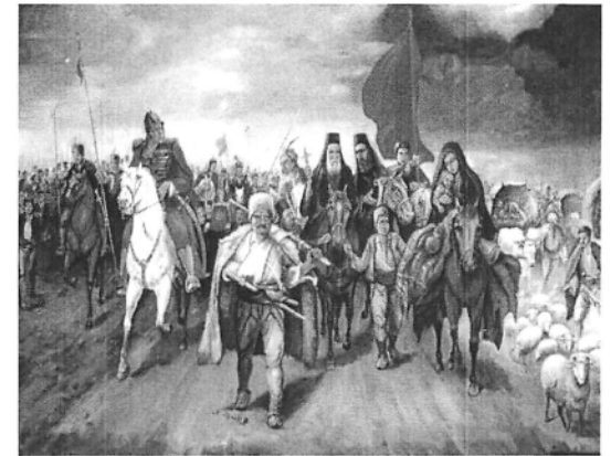
Exhibit: From the Serbian past