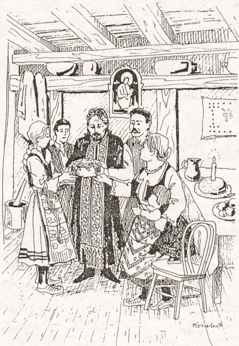
Serbian Krsna Slava Patron Saints Day